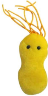
Cute as a bug: This week's second prize, a plush Helicobacter pylori bacterium. That's the ulcer one.

in which we asked simply for ways to tick people off. Given that we asked this in the wake of the Washington area power outages, many people equated the verb “PO” with the noun “P----o.”